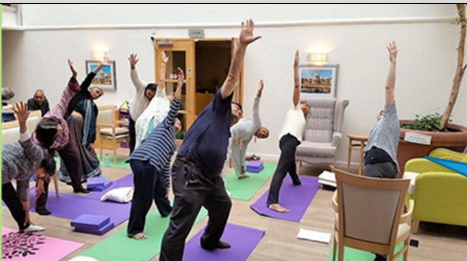
Photo of our first Yoga Class

We are pleased to announce that GCS have organised Yoga Class which started on Wed 18 th for elderly member's activity, with support from Sussex police grant towards the Hindu community. This was given to GCS to organise activities for the elderly. We have organised six Yoga sessions, one every Wednesday for next 5 weeks. It is FREE for all. Everyone is welcome to join.